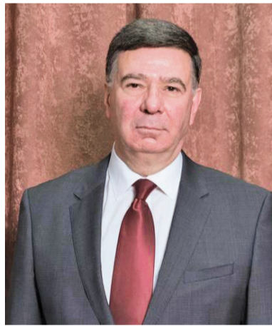
Deputy Minister of Foreign Affairs of the Russian Federation A.A. Pankin

Deputy Minister of Foreign Affairs of the Russian Federation A.A. Pankin in an interview says that the Eurasian Economic Union (EAEU) is one of the most advanced integration associations in Eurasia, within which there are no customs borders between the participants, there are "four freedoms" of movement of goods, services, labour and capital, and a common internal market.