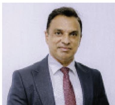
President of the Sri Lanka - Russia Business Council of the Ceylon Chamber of Commerce