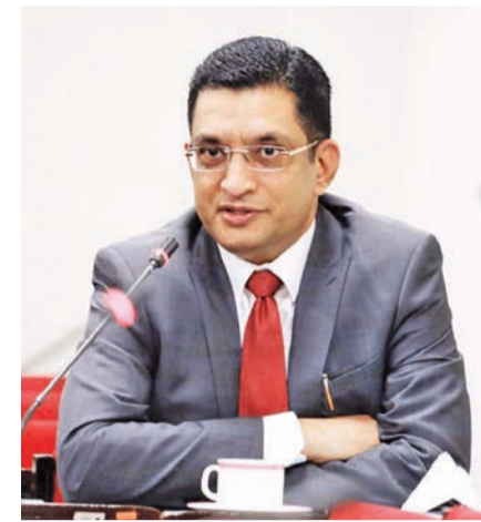
Minister of Foreign Affairs Hon. Ali Sabry PC.

I congratulate the Russian Federation's government and people on their National Day. Our two countries' friendly relations have been strengthened over time through meetings, high-level engagements and collaboration.