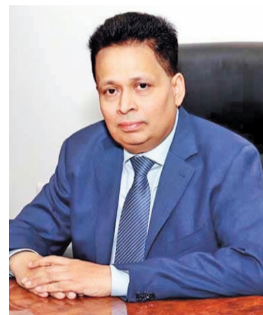
Former Sri Lankan Ambassador to Russia and General Secretary of the Sri Lanka - Russian Society

As the Former Sri Lankan Ambassador to the Russian Federation and General Secretary of the Sri Lanka-Russia Friendship Society, I am delighted to extend my best wishes on the occasion of the Russian National Day. This significant day commemorates the historic ratification of the Declaration of Sovereignty of the Russian Federation on June 12, 1990, marking Russia's Independence from the USSR.